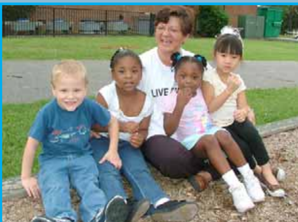
Volunteers, such as those from United Way Day of Caring, make a big impact on the children.

Our story has a happy ending. My husband found a good job in just three months. This would not have been possible if not for DHCDC's sliding scale. An increasing number of families in our community need it. We never thought we would be one of them.