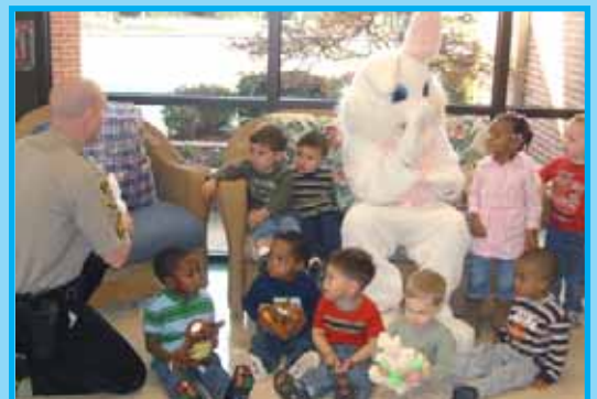
The Hampton Sheriff's Office brought the Easter Bunny and stuffed rabbits for all.