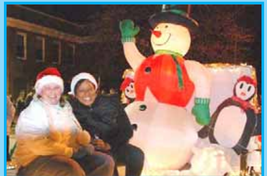
DHDCDC staff, parents and students rode a float for the Hampton Holly Days Parade.