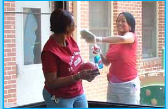
Target employees cleaned the indoor playground for our infants and toddlers.